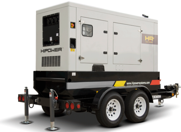
Photo depicts a typical model but may not include options such as trailer.

Standby - Applicable for a varying emergency load for the duration of a utility power outage with no overload capability.