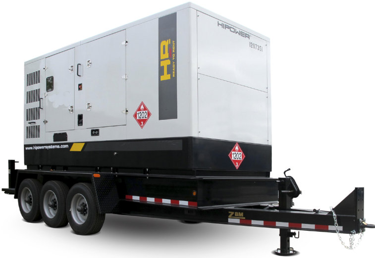
Photo depicts a typical model but may not include options such as trailer.