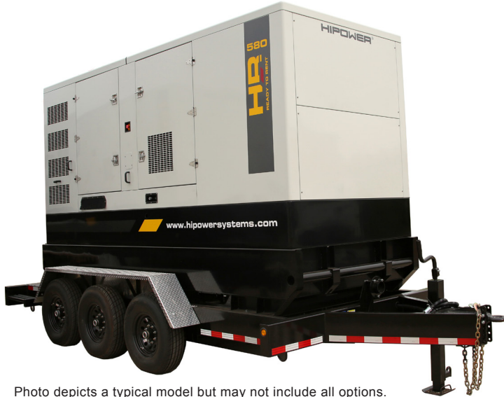
Photo depicts a typical model but may not include all options.