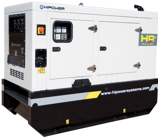
Photo depicts a typical Yanmar model but may not include options such as trailer.