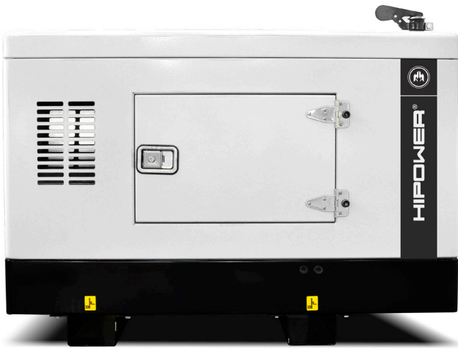
Generator depicted with sound attenuated option, some accessories for display only.