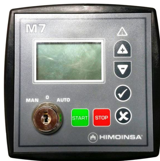
Pictures of Details Base Control Panel - Additional optional control and equipment and/or accessories available

Optional Alternator alarms offered: Overload, unbalanced voltage, over voltage, under voltage, over frequency, under frequency, short circuit, reverse power, and incorrect phase sequence.