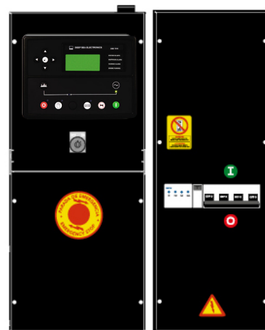
Pictures of Control Panel RH and Distribution Panel LH may include optional equipment and/or accessories

Alternator alarms included: Overload, unbalanced voltage, over voltage, under voltage, over frequency, under frequency, short circuit, reverse power, and incorrect phase sequence.