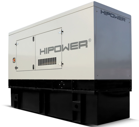
Generator depicted with sound attenuated option, some accessories for display only.