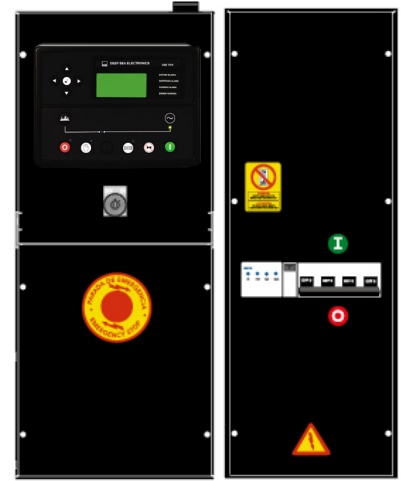
Pictures of Control Panel RH and Distribution Panel LH may include optional equipment and/or accessories

Alternator alarms included: Overload, unbalanced voltage, over voltage, under voltage, over frequency, under frequency, short circuit, reverse power, and incorrect phase sequence.