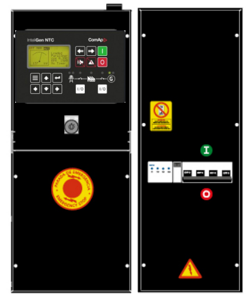
1200 AMP DISTRIBUTION PANEL

Alternator alarms included: Overload, unbalanced voltage, over voltage, under voltage, over frequency, under frequency, short circuit, reverse power, and incorrect phase sequence.